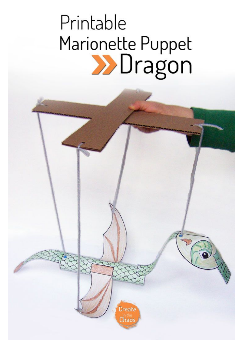
Photo and instructions courtesy of <a href="http://www.createinthechaos.com/printable-dragon-marionette-puppet/">http://www.createinthechaos.com/printable-dragon-marionette-puppet/</a>